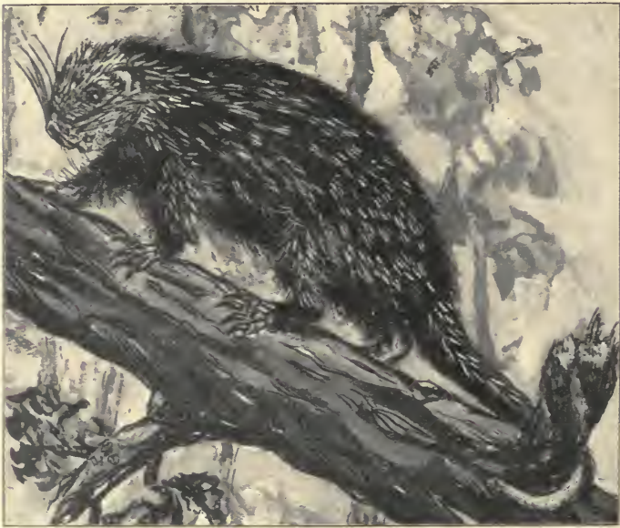
FIG. XXXIX. COENDU MEXICANUM. PREHENSILE-TAILED PORCUPINE.